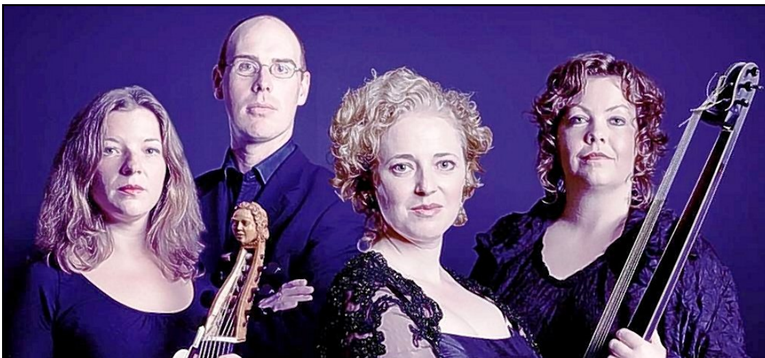
FRENCH FOCUS: Le Jardin Secret present a programme of French music