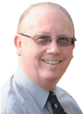
by PHILIP R BUTTALL Classical Music Writer

contact Jasper Solomon (01803 868883) or visit the website ( www.devonbaroque.co.uk ).